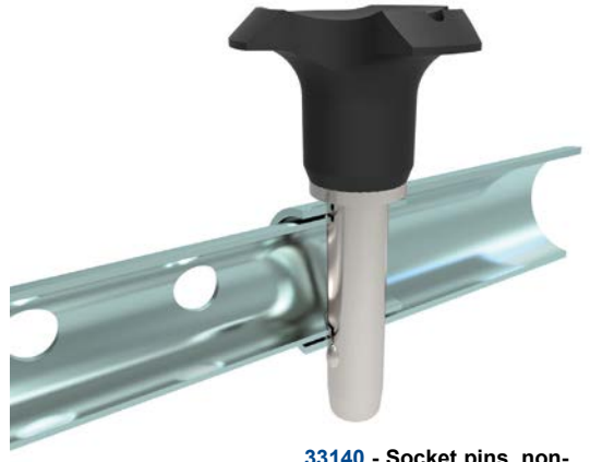
33140 - Socket pins, nonlocking, spring loaded balls.