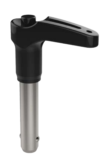
33220 - Ball lock pins, single acting - L-handle