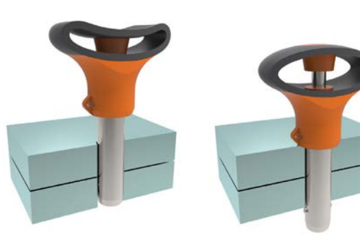
33100 - Single acting ball lock pin, self locking.