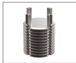
22046 - Inch - Stainless Steel Use installation tool no. 22050.