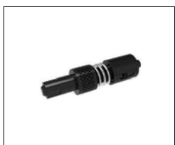
22050 for 22044 & 22046