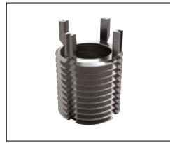
22010 - Heavy Duty - Metric - Inch. Use installation tool no. 22064.