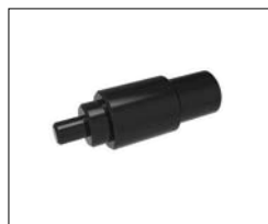
22064 for 22010 & 22012