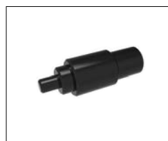
22060 for 22000 & 22004