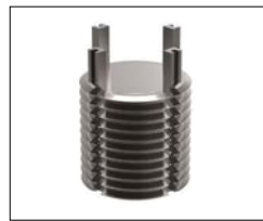
22044 - Inch - Carbon Use installation tool no. 22050.