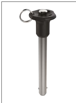
33600 - Single acting Pip-pin, standard B handle

With many years experience producing an extensive range of standard Pip-pins (also know as quick release pins or ball lock pins) we are now able to offer of Aviation Standard approved Pip-pins, manufactured according to NASM norms (formerly MS norms) and tested to NAS 1332 standards.