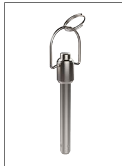
33630 - Single acting Pip-pin, standard R handle