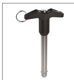
Single acting Pip-pin, standard TA handle