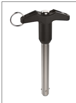
33610 - Single acting Pip-pin, standard TA handle