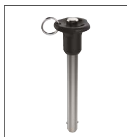
Single acting Pip-pin, standard B handle