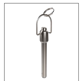
Single acting Pip-pin, standard R handle