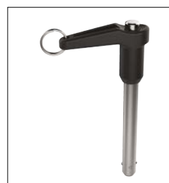
Single acting Pip-pin, standard LA handle