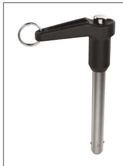
33620 - Single acting Pip-pin, standard LA handle